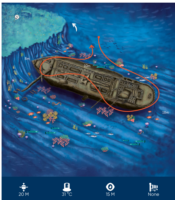
Site 1 (Chicken Wreck)